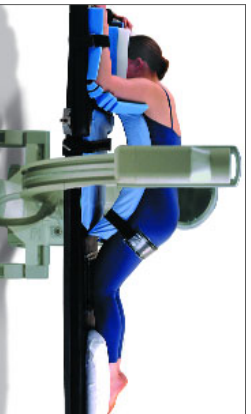
5319G — Wilson Plus OSI Imaging Table shown with unrestricted C-arm Lateral View

Wilson Plus frames offer 360 degrees of unobstructed radiolucency for easily obtainable images with either C-arm or X-ray.